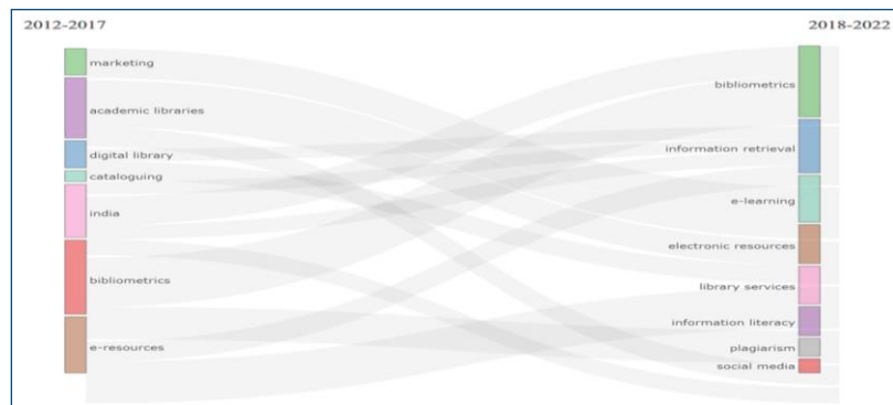
Fig. 4: Demonstrate the Thematic Development of Subjects

information literacy, e-resources and plagiarism are basic themes found in-between 2018 and 2022. Digital library and library services are identified in-between motor and basic themes, whenever intellectual property rights and h-index themes identified in between motor and niche themes.