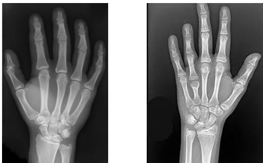
Fig. 1(a): X-Ray imag of right arm's fingers of human.

According to paper [2] imaging with X-rays involves exposing a part of the body to a small dose of ionizing radiation to produce images of the interior part of the body. In the human body, each bone plays an important role for example arm, leg, scalp etc. Figure 1(a) Courtesy: https://images.google.com/ shows X-Ray imag of right arm's fingers of human and Figure 1(b) Courtesy: https://images.google.com/ shows X-Ray imag of left arm's fingers of human.