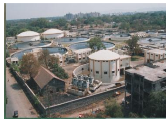
Fig. 3: 130 MLD Sewage Treatment Plant at Tanajiwadi