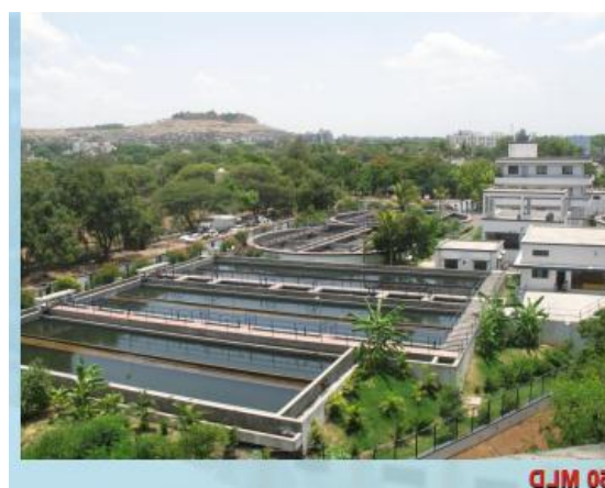
Fig. 1: 60 MLD Sewage Treatment Plant at Erandwane