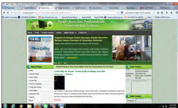
Fig 1: The “best seller”Page