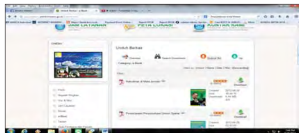
Fig 3:“E-Book” page

The collections displayed on this page are still very limited, so if a user needs to know another kind of collection, they have to come directly to the library. We can see the display of library OPAC in Fig. 4.