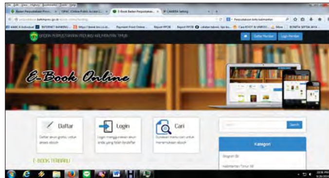
Fig 6:E-Book Page

we can see there is no website that is accessible to users with disability. There are not available system functions such as enlarging the screen, voice command settings, information in Braille writing, or information in audio format, which can be used by people with disability when accessing services in the digital library.