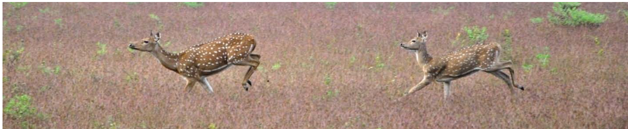
TADOBA

ONE WHO IS FOND OF FOREST OR FOREST SCENERY. DISCOVER YOUR INNER NEMOPHILIST IN THE MAGICAL FORESTS OF INDIA. GET TO KNOW THE DEPTHS OF THESE LUSH GREEN JUNGLES AND THE WILD AND BEAUTIFUL FLORA AND FAUNA THAT INHABIT IT.