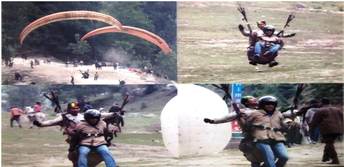
Pic: Author in Pic